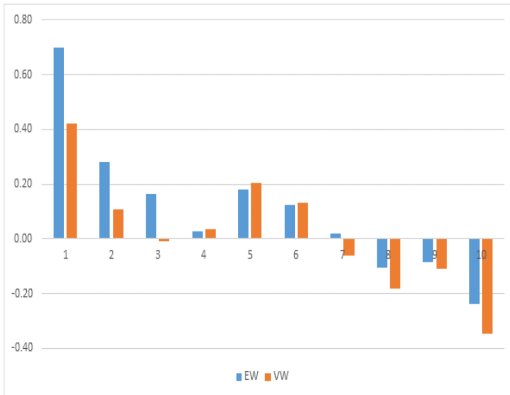
Figure 3: 4-Factor Alphas of Decile Portfolios Sorted on ETF-based Short Ratio

This figure shows the monthly Carhart (1997) 4-factor alpha for decile portfolios sorted on ETF-based stock short ratio. The y-axis is the monthly alpha (in percentage), and the x-axis is the decile portfolio from low to high. The sample runs from January 2002 to December 2013.